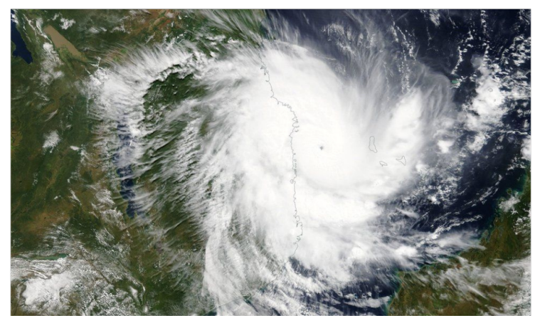
5-9 September 2022 Maputo, Mozambique Concept Note